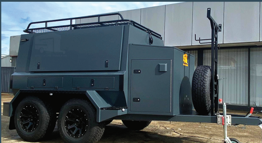
Security locks all doors