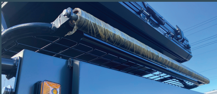
Roof rack on roof with user-friendly rear roller