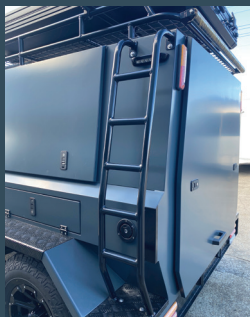
Roof access ladder +ladder rack on draw bar