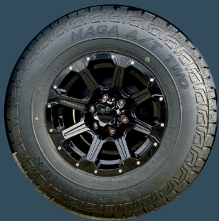
Spare Tyre x 1