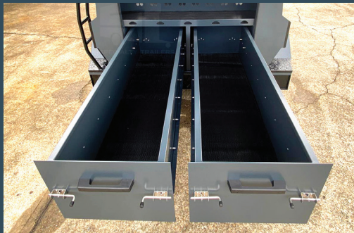
Rear slide out drawer x 2 1740mm(L)x510mm(W) x400mm(H)