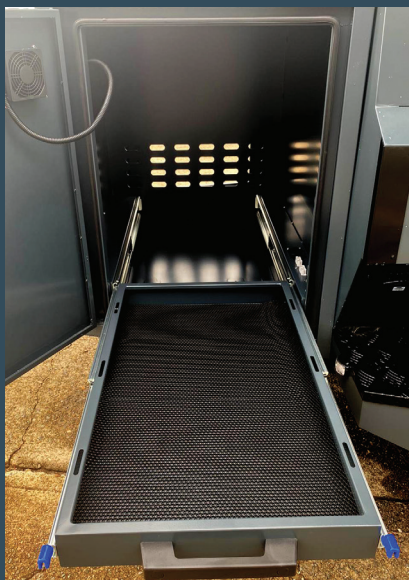
Front box with fridge slide to secure your appliances